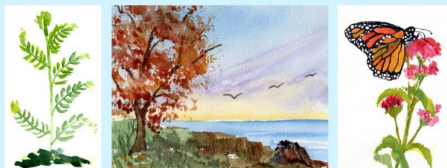
Fiona McGaw often makes small watercolour sketches that are used for the Pastoral Care greeting card ministry