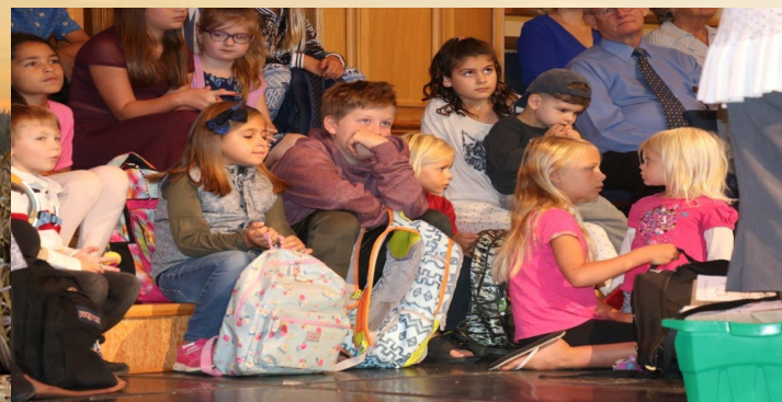
Blessing of the Backpacks, Sunday September 1

An important part of building a safe and inclusive environment for children and youth is ensuring that we have up to date information and permissions. We encourage all parents/guardians of children who attend First Contact, Nursery, either youth group, or Treasure Time for Tots to complete a 2019 Child and Youth Information Form , found on our website. The form is quick and easy to complete and allows you to select which programs your child is likely to attend.